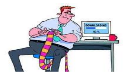
(as a result)

5 Driving on city highways can be very confusing. Furthermore, it can give you a terrible headache.