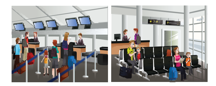
(after that) At the airport, people have to check in for their flights. After that, they go to wait at the boarding gate.