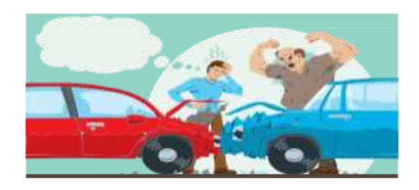
(consequently) 8 He drove carelessly. Consequently, he had an accídent.